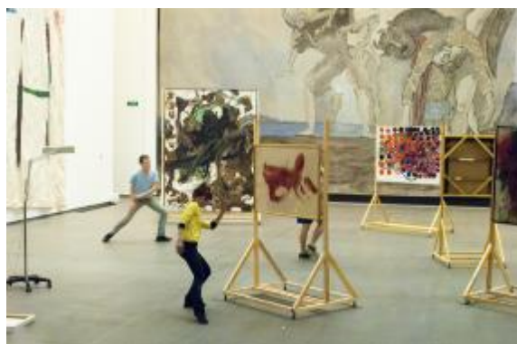
Ei Arakawa, See Weeds , 2011 installation/performance view Les Abattoirs, Toulouse, Photo: Marc Boyer Courtesy of the artists