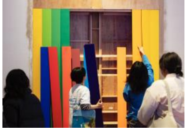
Ei Arakawa-Nash, Panel (Ellsworth Kelly, Spectrum I, 1953) , 2024 installation/performance view The National Art Center, Tokyo, Photo: Shu Nakagawa Courtesy of the artists and The National Art Center,