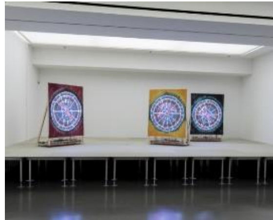
Ei Arakawa, Performance People , 2018 Kunstverein für die Rheinlande und Westfalen, Düsseldorf