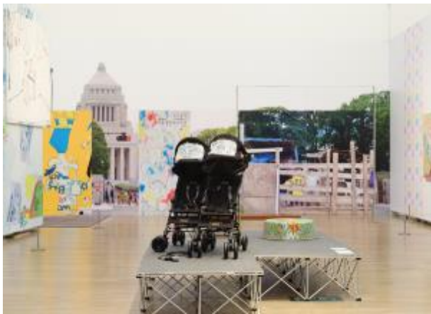
Ei Arakawa-Nash, Paintings Are Popstars , 2024 installation view The National Art Center, Tokyo, Photo: Shu Nakagawa Courtesy of the artists and The National Art Center, Tokyo