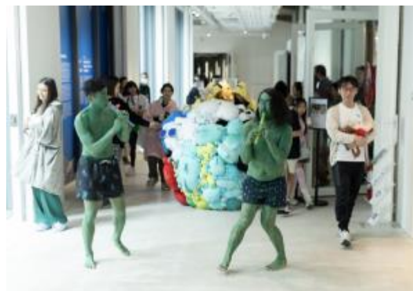
Ei Arakawa-Nash, Plush Subjectivity , 2024 performance view Centre for Heritage, Arts and Textile, Hong Kong, Photo: Spark Photography Courtesy of the artist