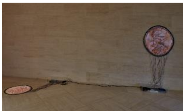
Ei Arakawa, 2021 installation view at Post-Capital, The Grand Duke Jean Museum of Modern Art, Luxembourg