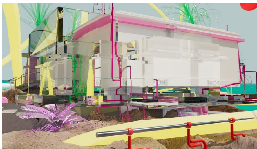
Concept image of renovation of the Japan Pavilion in Venice