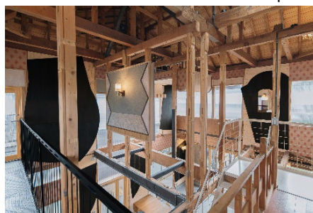
SUNAKI, Shodoshima House, 2022 ©Kaori Yamane