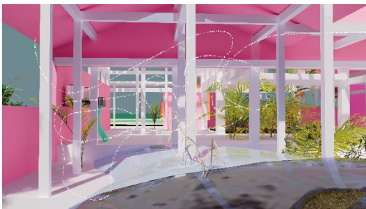
Asako Fujikura + Takahiro Ohmura, Fixing Garden, 2022-