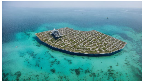
Asako Fujikura + Takahiro Ohmura, Trans-prompt, 2023